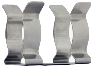
Mounting Clip Model MC2031