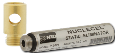
Replacement cartridge and tip Model P-2021-8001