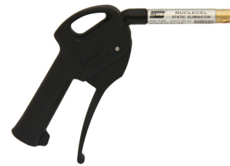
Pistol grip style handle Model ST1