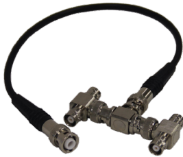
Alphaboo™ 4-1 Splitter (One Alphaboo™ Controller can power up to four Heads using the 4-1 Splitter) MODEL AB-SPL