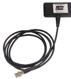
Alphaboo™ Single Balance Extender Kit (Includes one Head with a 2-meter cable, one 2U500 ionizing cartridge and one BF3 EZ Mount) MODEL AB-EK