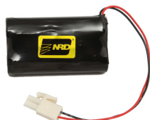
Replacement Battery Model 6500-BAT