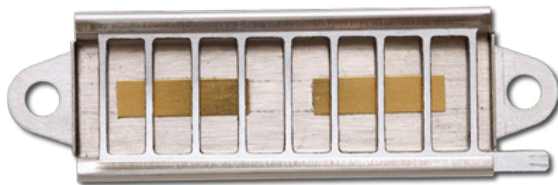
Alpha Ionizer Model 2U500