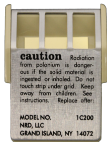
Replacement Cartridge for the 1C200 Model 1C200R