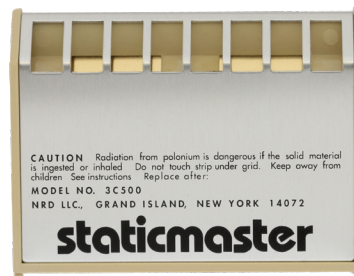
Replacement Cartridge for the 3C500 Model 3C500R