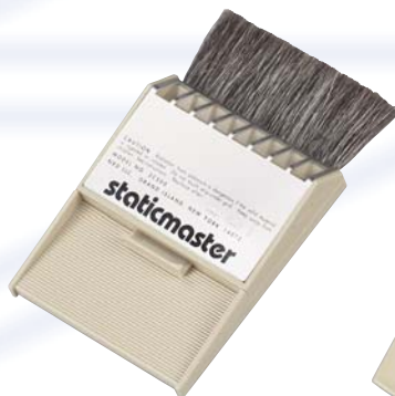
3C500 3" brush