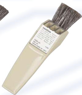
1C200 1" brush

When weighing fine powders and fibers, the balance chamber must maintain a stable static free environment to assure accurate results. The problem of "fly-away" powders and inaccurate weighing is eliminated with the 2U500 and 1U400 microbalance ionizers , because they utilize proven alpha ionizing technology. These devices can be easily mounted within the balance chamber, assuring quick and accurate measurements.